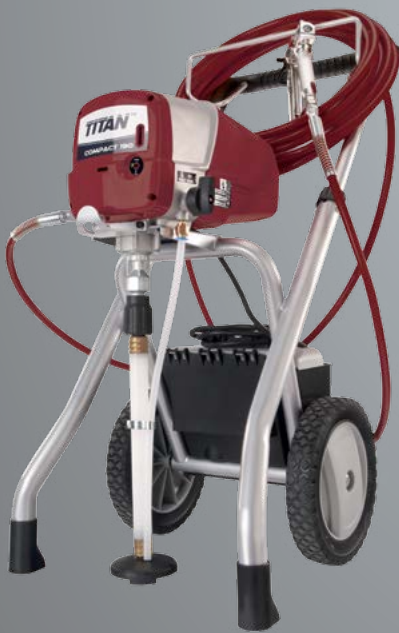
TITAN Compact 190