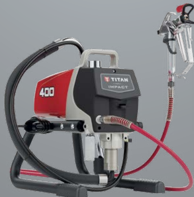
TITAN Impact 400