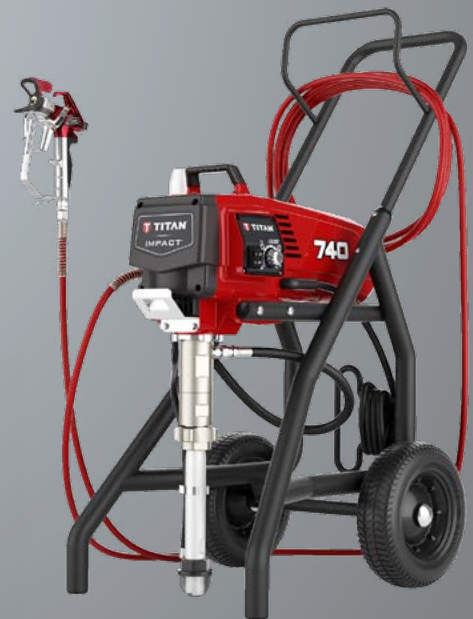
TITAN Impact 740