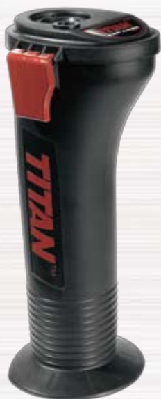
Titan PUMP RUNNER