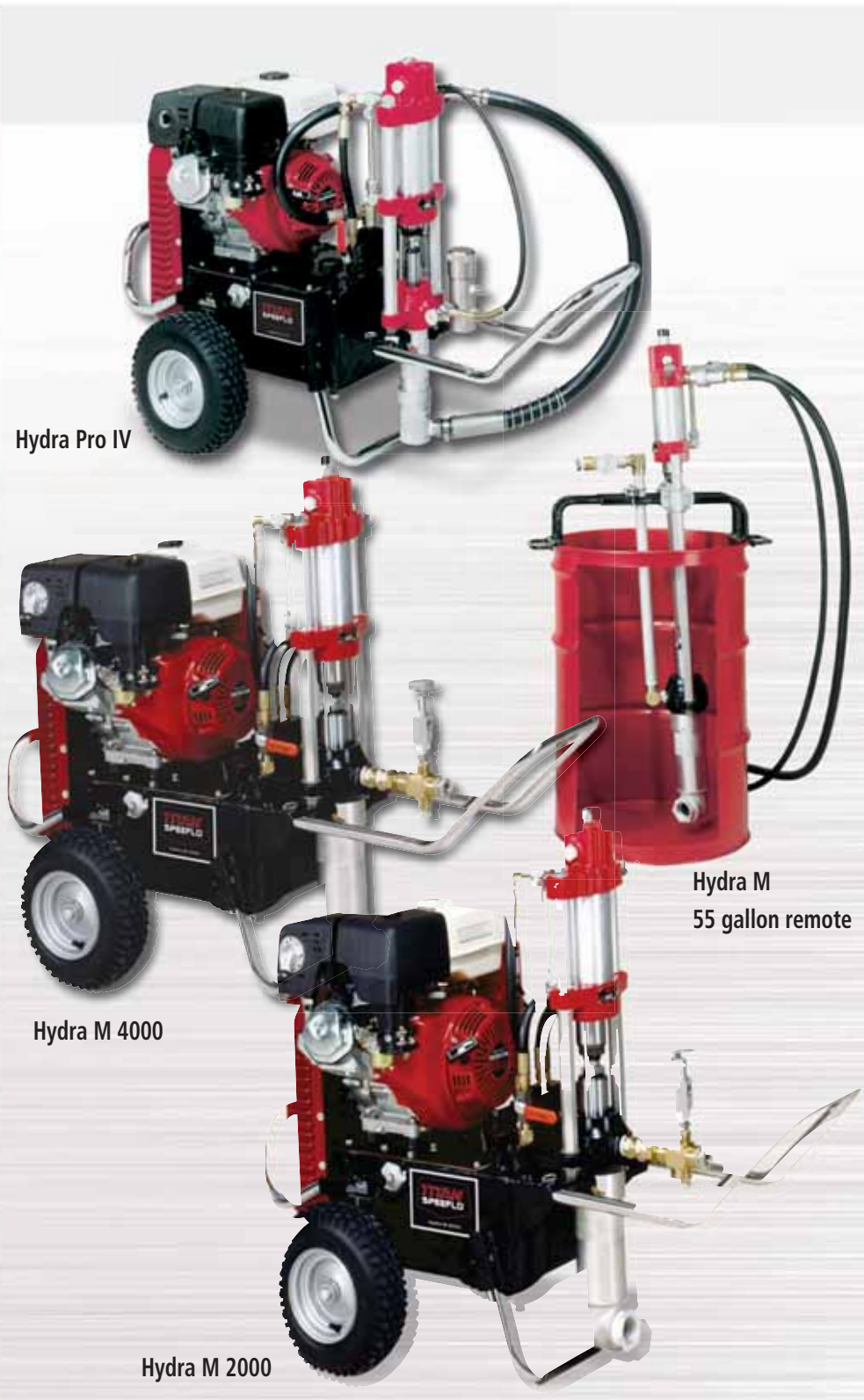
Hydra Pro IV

Extra pressure for hard to atomize coatings such as bonding cements for single membrane coatings