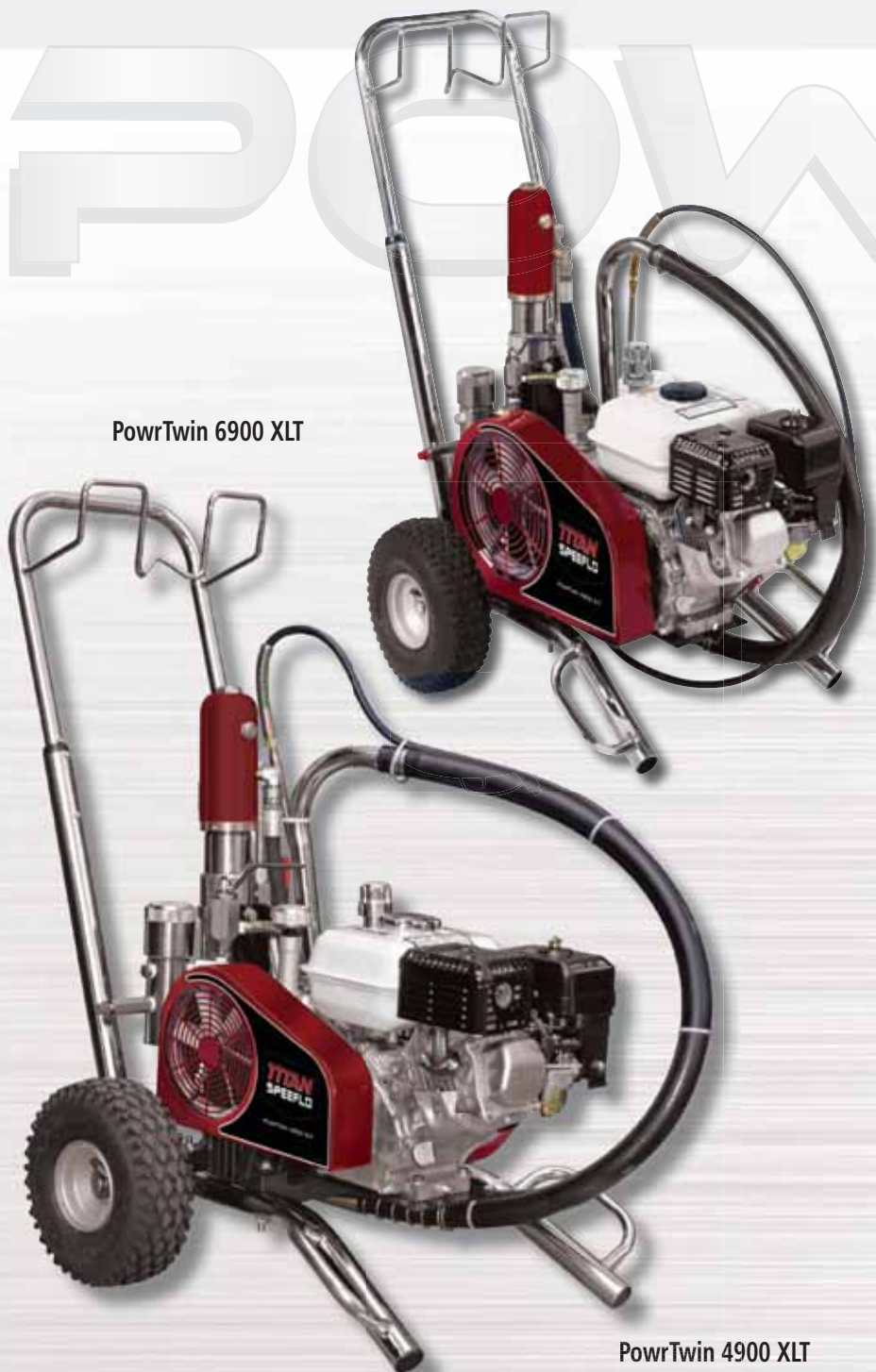
PowrTwin 6900 XLT

Runs 20% cooler with no clutch to wear and no routine maintenance