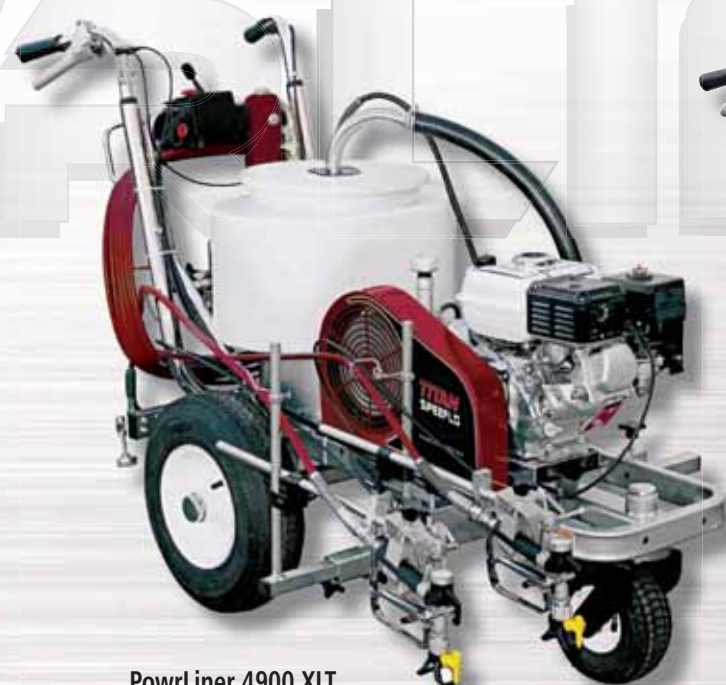
PowrLiner 4900 XLT