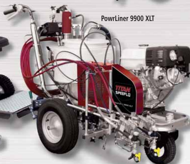
PowrLiner 9900 XLT

Recommended for Medium to Large-Scale Projects on Airports, Roads, Parking Lots and Athletic Fields.