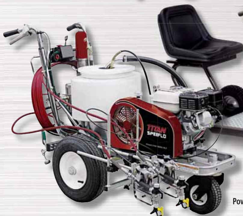
PowrLiner 8900 XLT