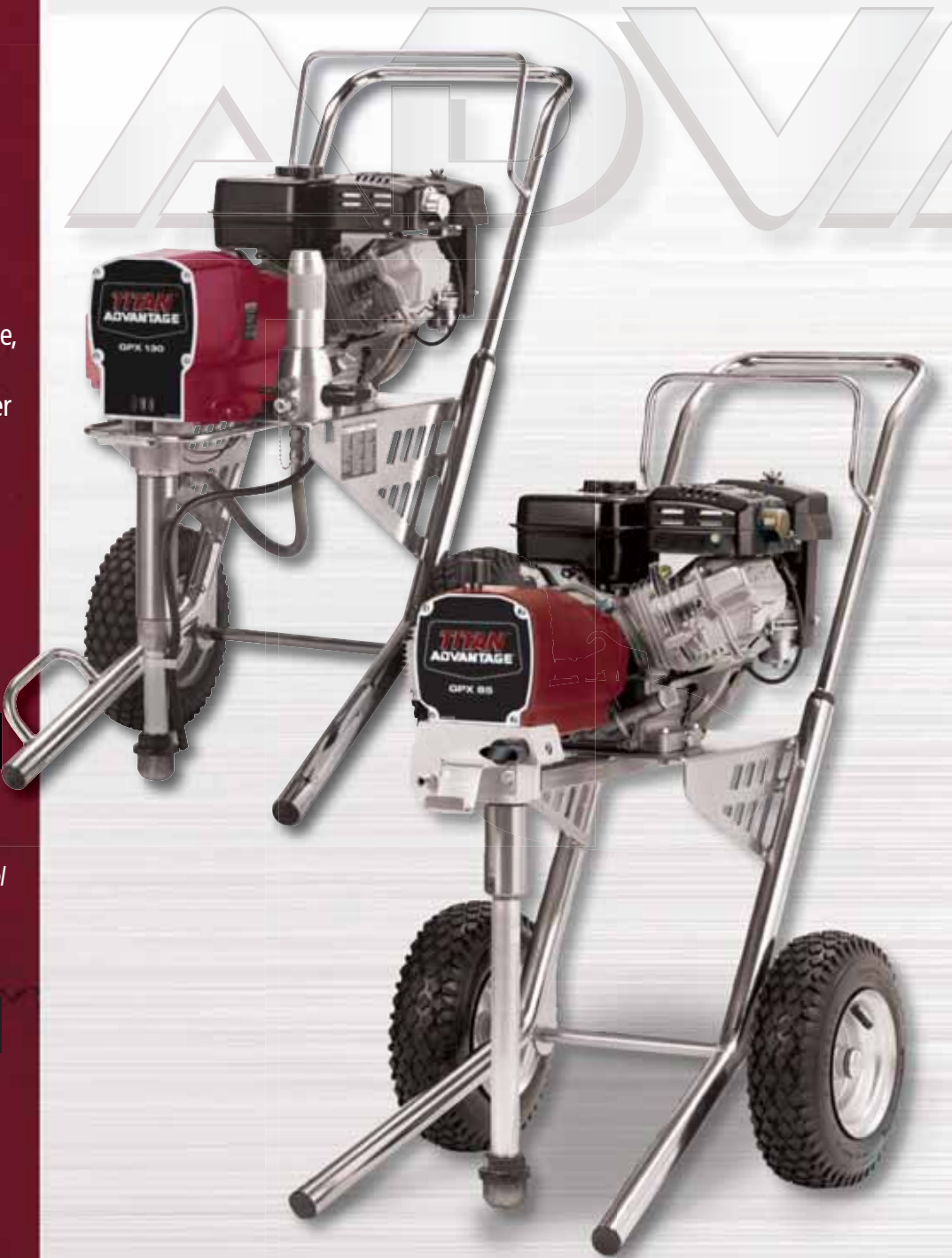
All units come complete with gun, tip & hose.

Static packings for increased packing life