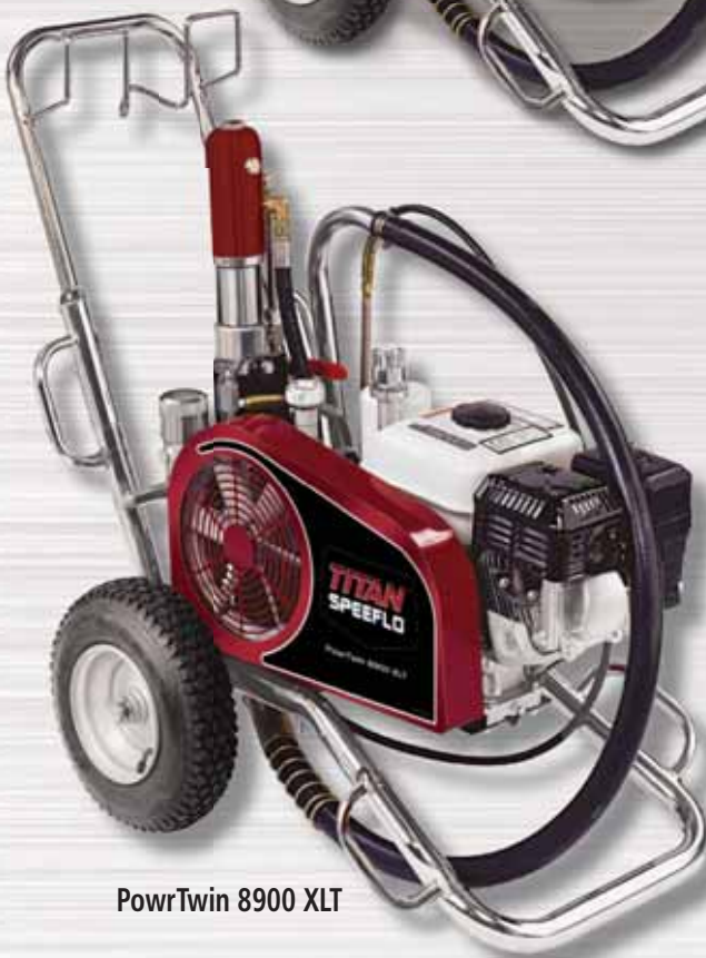
PowrTwin 8900 XLT