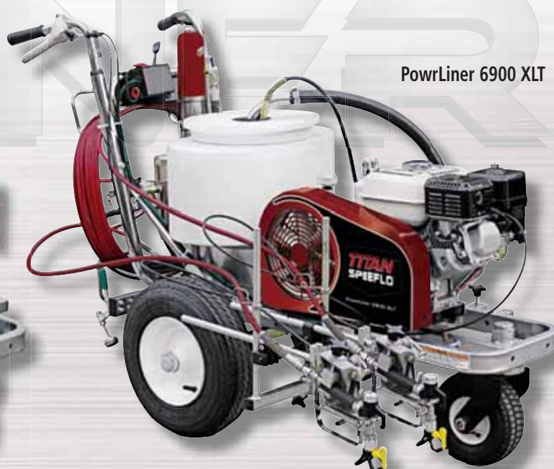
PowrLiner 6900 XLT