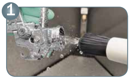
Clean the material passage