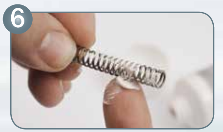
Grease and insert paint needle spring

Over the years, the silicone-free SATA high performance spray gun grease which is compatible with paint has proven to be the perfect maintenance agent when thinly applied on all moving components as well as on all threads. This ensures free movement and perfect function of the components even after many years of use. Illustration see above - Art. No. 48173