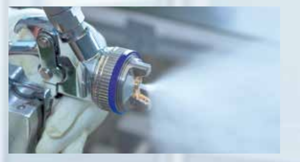
100% spray pattern check: This results in a perfect spray pattern meeting highest quality expectations.

Additional advice regarding maintenance and servicing can be found in the internet on www.sata.com/firstaid. In case of questions we will be glad to provide personal advice under the phone number (+49) 7154/811-200!