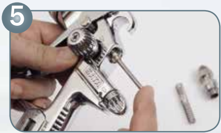
Insert paint needle