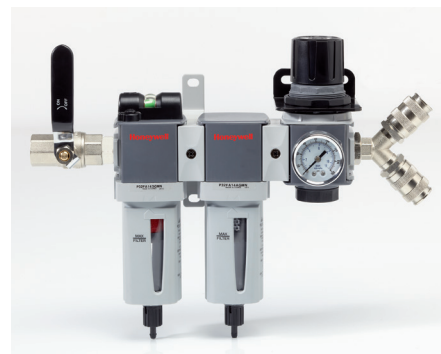
Wall mounted combination system