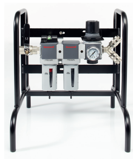
Portable, stand mounted combination system